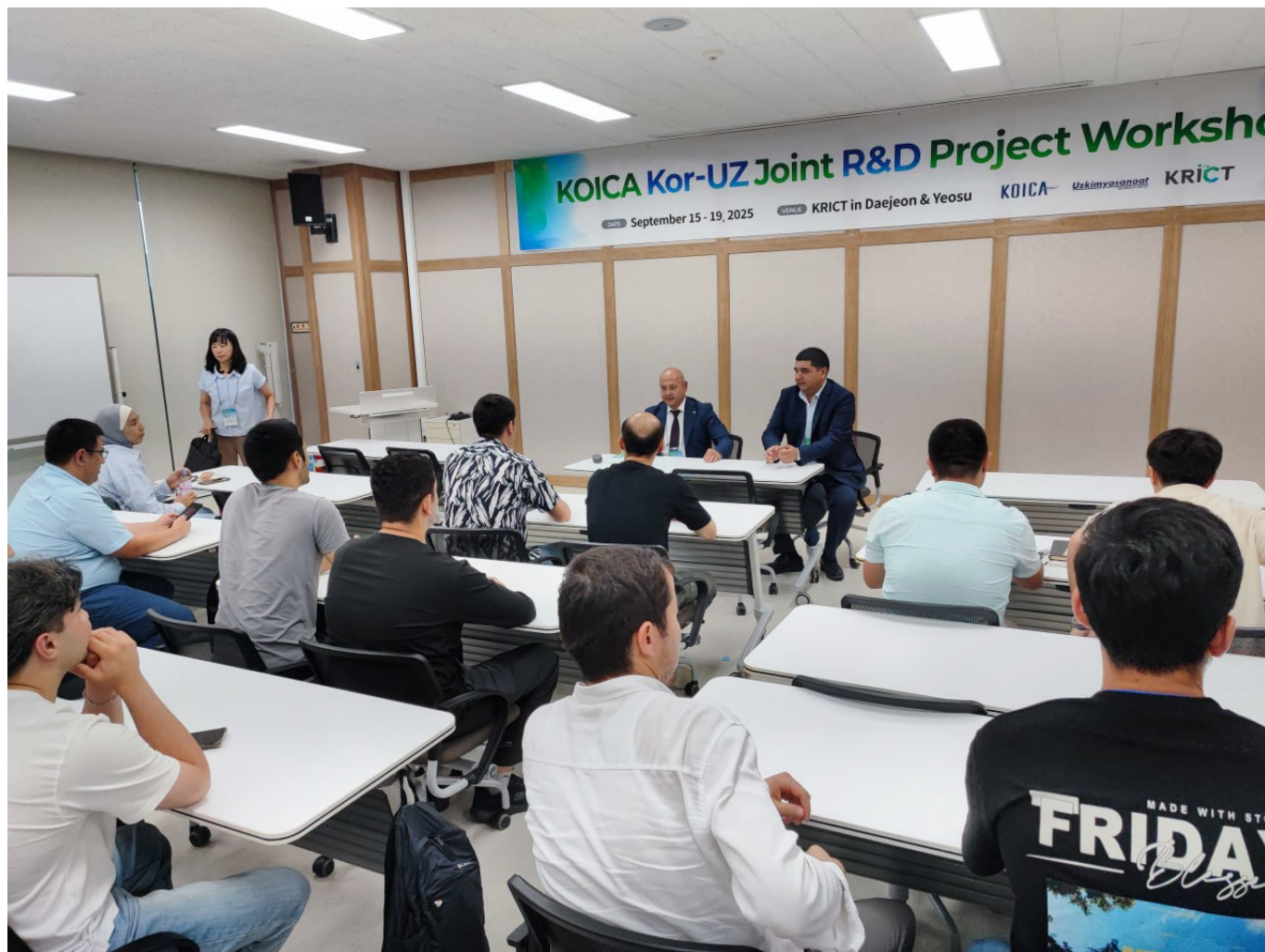
Press Service of "Uzkimiyosanoat" JSC